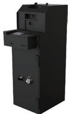
KUAN Lite with Cover